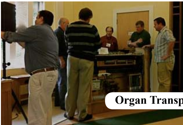
Organ Transplant Team