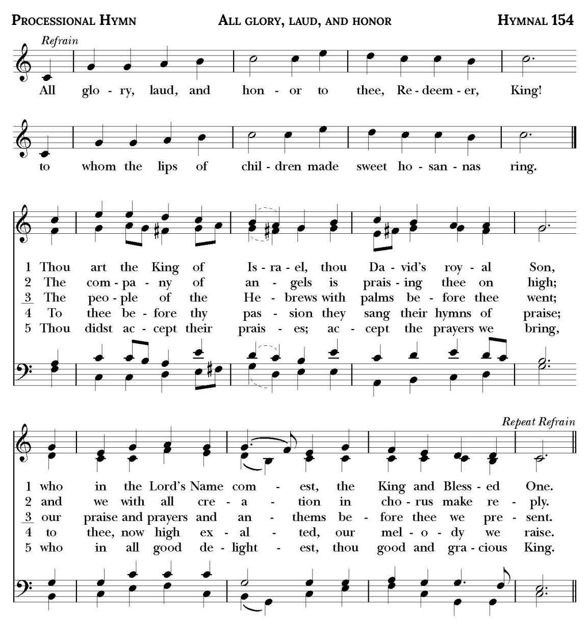
The stanzas may be sung by choir alone or alternately by contrasted groups; all sing the refrain.

Words: Theodulph of Orleans (d. 821); tr. John Mason Neale (1818-1866), alt.